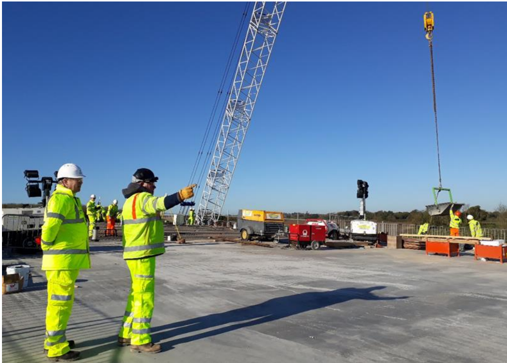
Construction of the Girton Interchange Bridge

Sections 4 & 5: Our temporary bailey bridge near Swavesey junction has enabled our trucks to transport 20,000 loads of construction material (160,000 cubic metres) over the A14 to form part of the new Swavesey junction, with no impact to road users. It is due to be removed during the week commencing 25 th November 2017, after which time it will be stored for a short period then re-used to perform a similar operation near the Girton junction.